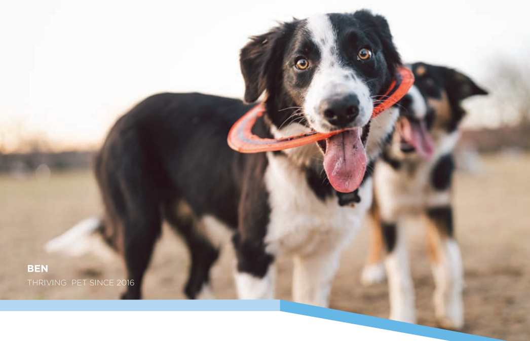
BEN THRIVING PET SINCE 2016